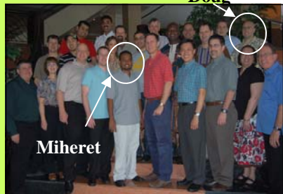
Global Technology Leadership